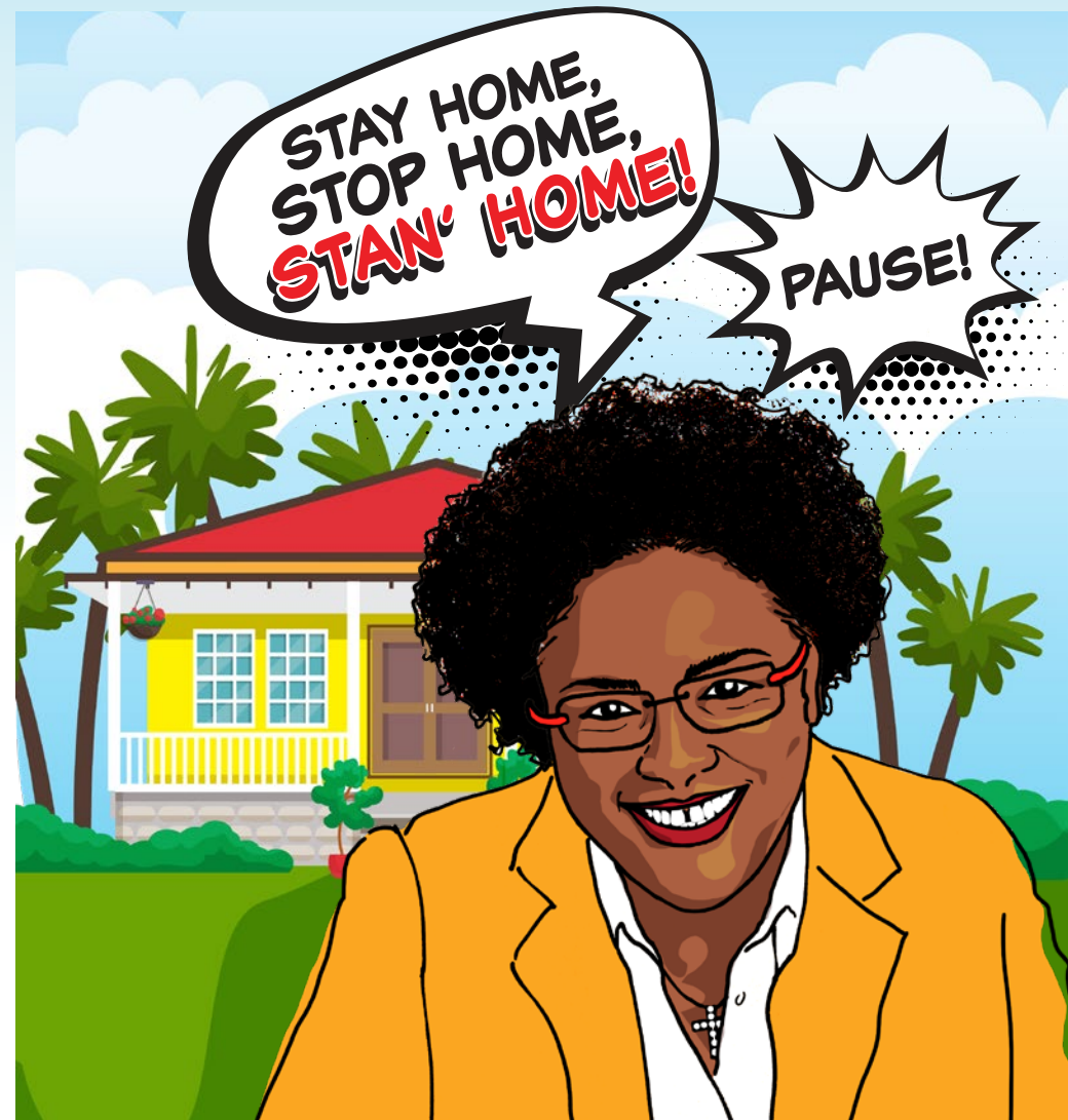
The Hon. Mia Amor Mottley, QC, MP, EGH, OR Prime Minister of Barbados Address to the Nation, January 26, 2021